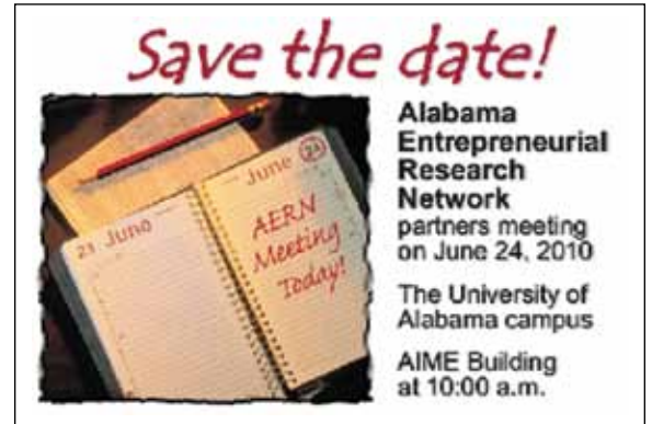
ABOVE The Annual Partners Meeting in Tuscaloosa gives members of the network the opportunity to share ways of spreading the AERN message and to hear from UA and other business experts.