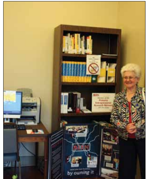
ABOVE The interior of the AERN center in the Pickens County Library is seen. It was rededicated in 2010.