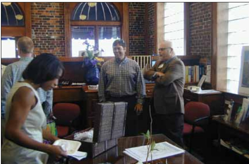
LEFT Residents observe and try out the equipment during the grand opening of the new AERN center in Butler County.