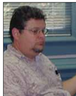
Phillip White Technology